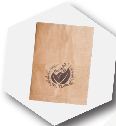
CHIC ECO Recycled Kraft Bag