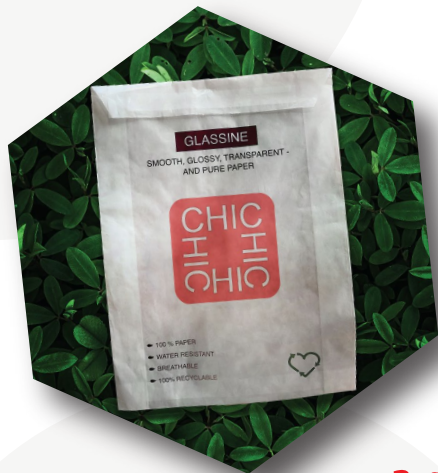
CHIC Glassine Paper Bag