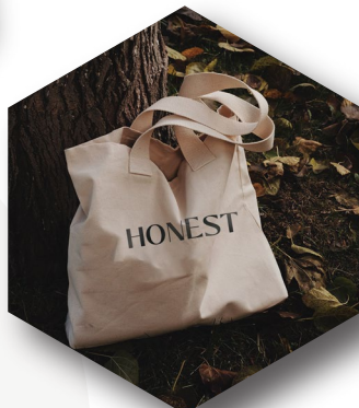
HONEST Canvas Tote Bag