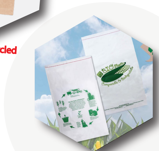
Chic Collection Bio-Plastic Polybag Corn Starch